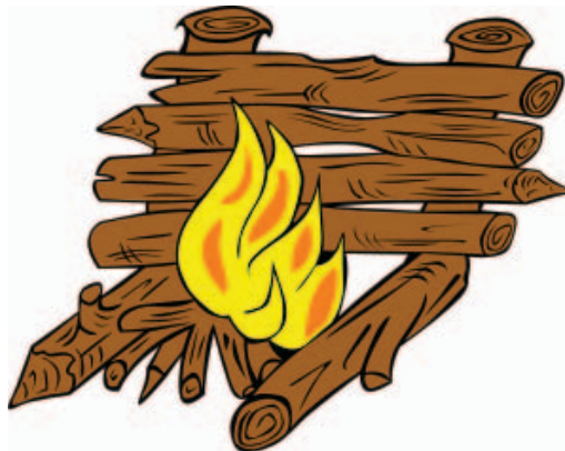
Figure 14.4 - Reflector fire