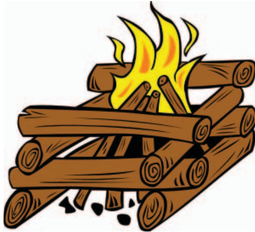
Figure 14.5 - Rectangular fire

Rectangular bonfire is built by placing pieces of firewood inside a structure that is made by placing logs in a rectangular shape as shown in the figure.