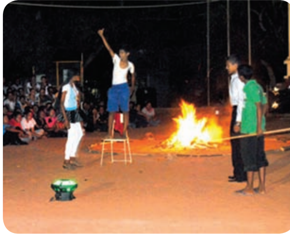
Figure 14.9 - Bonfire displays

On most occasions lighting the bonfire is done in the form of a display. They are called bonfire displays.