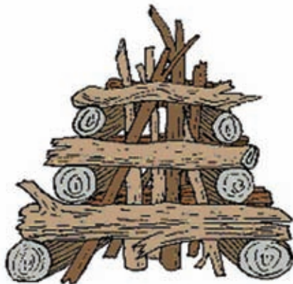
Figure 14.6 - Pyramid fire