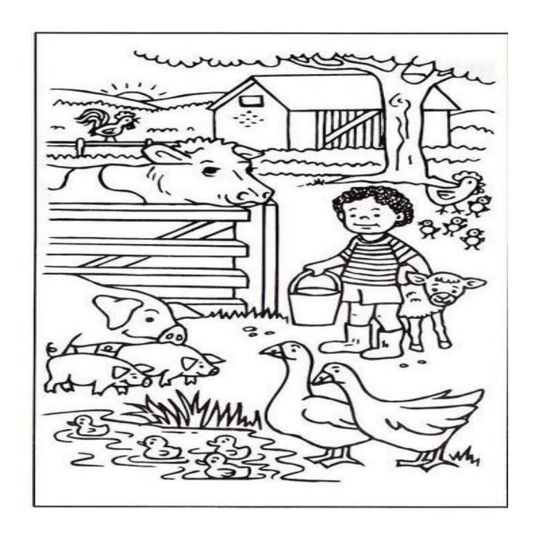
Test 3 Study the picture and fill in the blanks in the text given below. Use only one word in each blank.