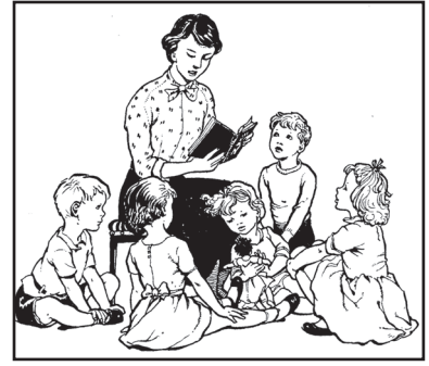
Geetha / story

Look at the pictures. Write what each friend's mother will be doing during the next weekend. The first is done for you.