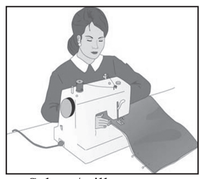
Sahan / pillow case

1. Geetha's mother will be reading a story to us.