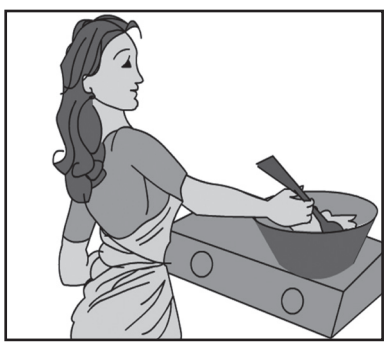
Kusal / soup