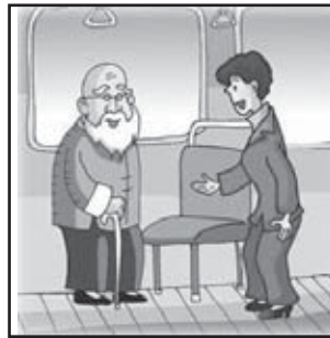
offering a seat to an old man