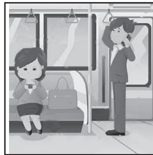
Keeping bags on seats in a public vehicle