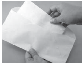
put and seal