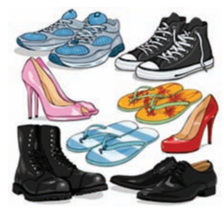
moccasin - /ˈmɒkəsɪn/

Though men's shoe styles remained relatively unchanged, women's shoes made dramatic changes in their appearance.