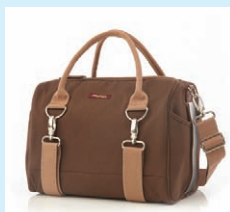
a bigger bag