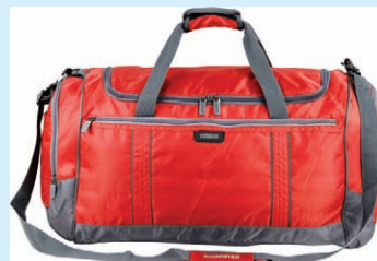
the biggest bag

We can change the words and their meanings by adding suffixes to words at the end. These new words help to compare.