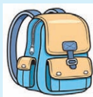
a big bag