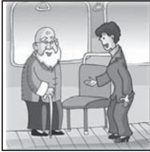
offering a seat to an old man