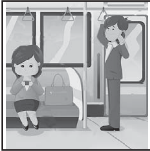
Keeping bags on seats in a public vehicle