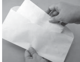
put and seal