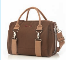
a bigger bag