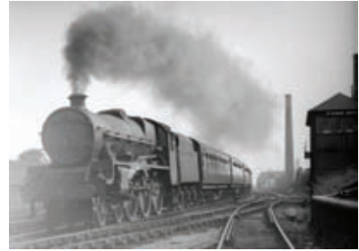
A train with a steam engine

With the passing of the Education Act in 1945, free education prevailed as a public service. Dr. C.W.W. Kannangara is honoured for introducing free education to Sri Lanka.