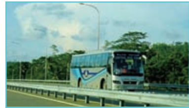
A luxury bus running on an express way