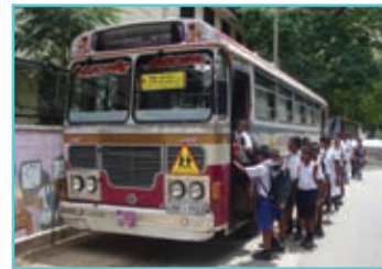
A “Sisu Seriya” bus

Private sector too contributes to facilitate the transport of students.