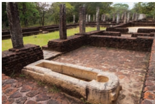
Ruins of an ancient hospital