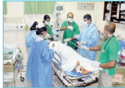
Electricity for hospitals