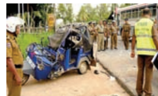
An inquiry of an accident