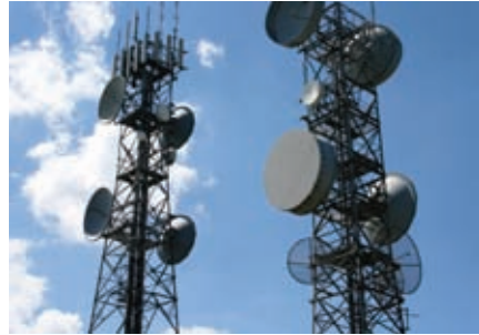
A communication tower

Many services have developed fast due to the industrial and technological development. Services like communication can be taken as an example for this. A large amount of expenditure has to be borne in order to provide these facilities. These services are essential for the people.