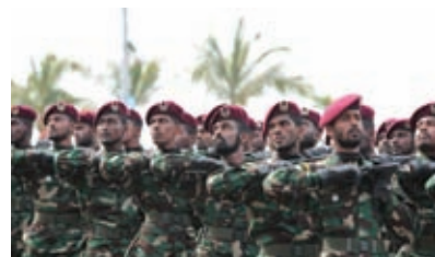
Army salutation in a State ceremony