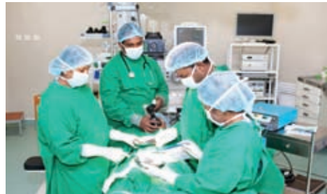
Carrying out an operation on a patient

At present, Sri Lanka has been able to bring the infant mortality rate and the maternal mortality rate to a lower level. The life expectancy also has been brought up to a higher level. It has been able to control diseases such as leprosy, polio, filariasis and tuberculosis to a large extent.