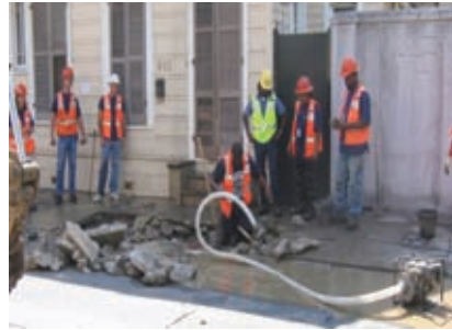
A group of workers repairing a water supply system