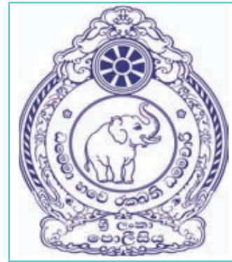
Official logo of the Police

Sri Lanka Army, Sri Lanka Navy, Sri Lanka Air Force and the Civil Security Force also perform a major role in providing security to the public. Examples for services rendered by the security forces are;