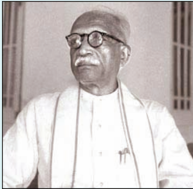
Mr. C.W.W. Kannangara

With the passing of the Education Act in 1945, free education prevailed as a public service. Dr. C.W.W. Kannangara is honoured for introducing free education to Sri Lanka.