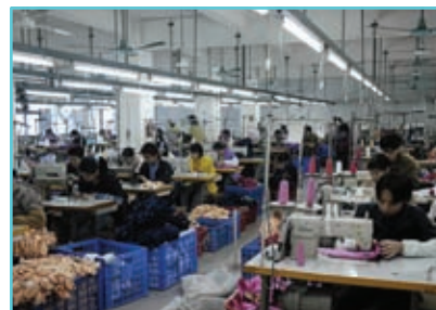
Electricity for industry