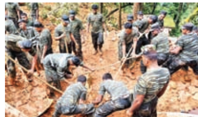
Providing military service in a disaster situation