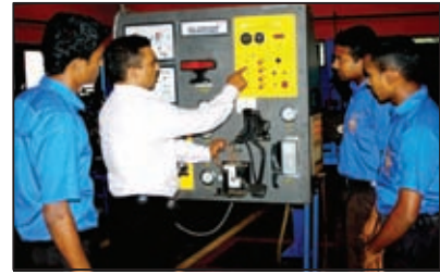
A vocational education situation

Draw your attention to the descriptions given by the following persons regarding their education and employment.