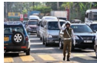
Police officers controlling traffic