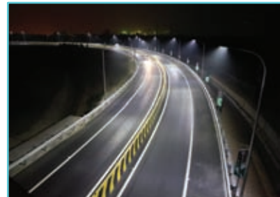
Electricity for streets