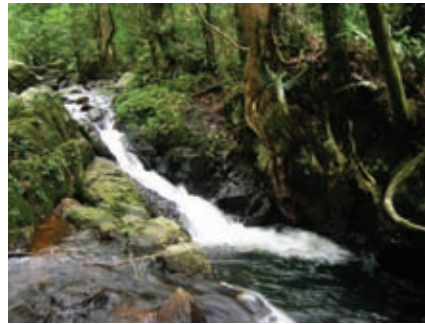
Sinharaja rain forest