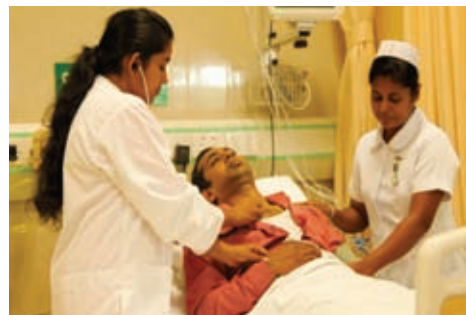
A doctor treating a patient