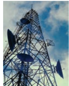
Ac communication tower