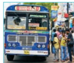
A private bus