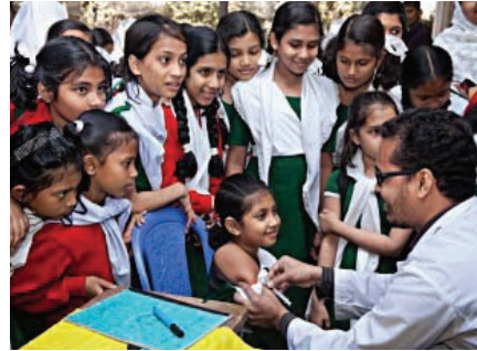
A medical clinic