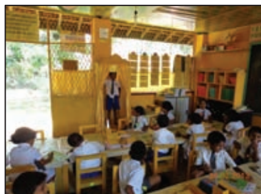
Students studying in a primary class