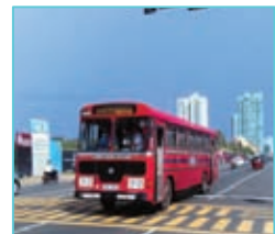
An S.L.T.B. bus