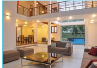
Electricity for houses