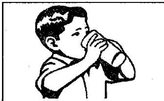
drink, milk, morning

The following pictures show what Saliya did last Sunday . Write a sentence about each picture. Use the words given below the picture. Each sentence must have at least five words . The first one is done for you.