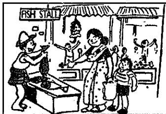
walk, fish stall, mother