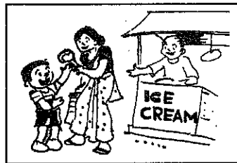
take, ice cream, mother