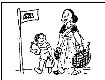
carry, bags, bus stop