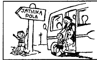
go, fair, mother