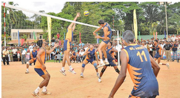
Figure 4.1 - A game of playing volleyball

In this lesson, we will learn about the rules and regulations related to positions that are very important in playing volleyball.