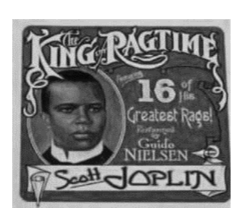
The Entertainer Scott Joplin American Composer

https://classicalfm.ca/station-blog/2019/11/19/king-ragtime-scott-