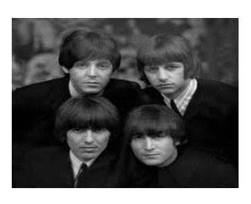
Yesterday Beatles (Group of 4 singers)