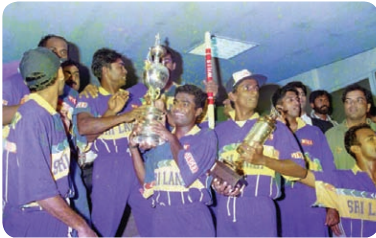
Figure 2.2 - Being a professional sportsman

By developing one or more of your abilities, you can be a professional in that field. Every person has talents that are unique to him. These abilities are inherent. According to the inherent strengths we have, we should identify a target and strive to achieve it without obstructing others. You can bring honour and glory to your community and the country by developing your abilities. The satisfaction, joy and pride you get by this is known as self actualization.