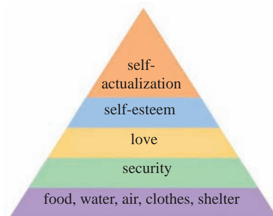
Diagram 2.1 - The hierarchy of human needs (Abraham Maslow)

Abraham Maslow a psychologist who did a lot of experiments on human needs described the hierarchy of human needs shown below.