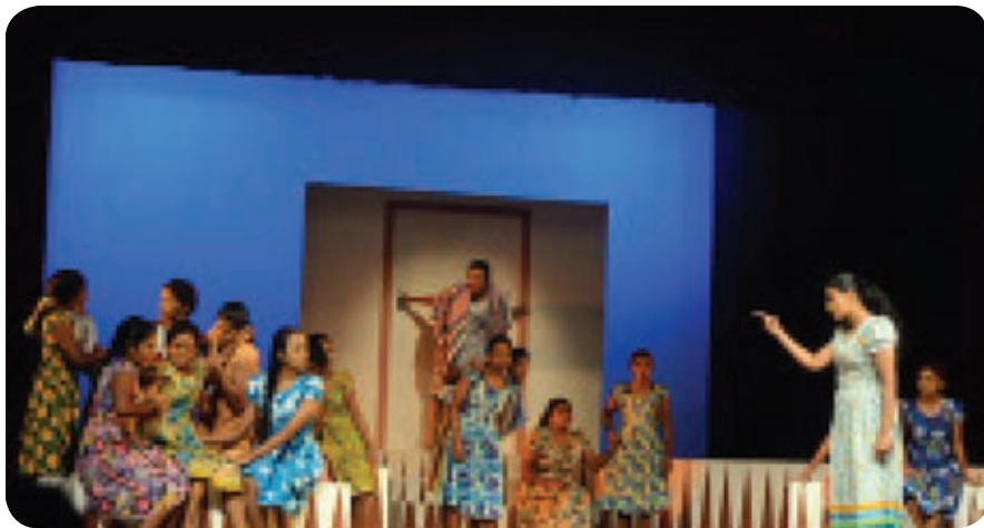
Figure 2.1 - Displaying Aesthetic skills