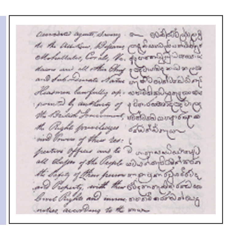
An extract from the Kandyan Convention

The Kandyan Convention of 1815 marks an important turning point in the history of Sri Lanka. By this Convention, the last existing in dependent Sinhala kingdom fell to the British bringing the entire island under foreign domination for the first time.