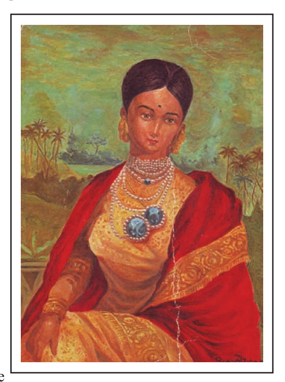
Figure 1.4 "Rangamma" Queen of King Sri Vikrama Rajasingha

The attempt made by the British to conquer Kandy in 1815, thus became successful. All previous attempts made by Europeans - the Portuguese, Dutch and even the British - to conquer Kandy had hitherto ended in failure. The main factors which were conducive to the conquest of Kandy by the British were the development of hostile relationships between the king, the Radala chiefs and the people, and the loss of the loyalty of the people to the king.