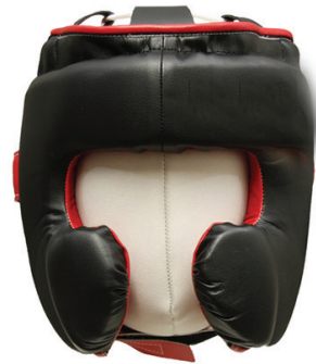
Figure 6.6 - Head gear for Boxers

While participating in sporting events, the participants meet with various accidents. These accidents could happen due to several reasons such as the manner in which the game is played, the type of equipment used etc. Therefore, standards have been defined through rules with regard to the use of equipment and participants cannot use equipment as they wish. Rules define the manner in which the participants should play the game.