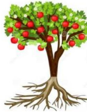
In Summer (now)