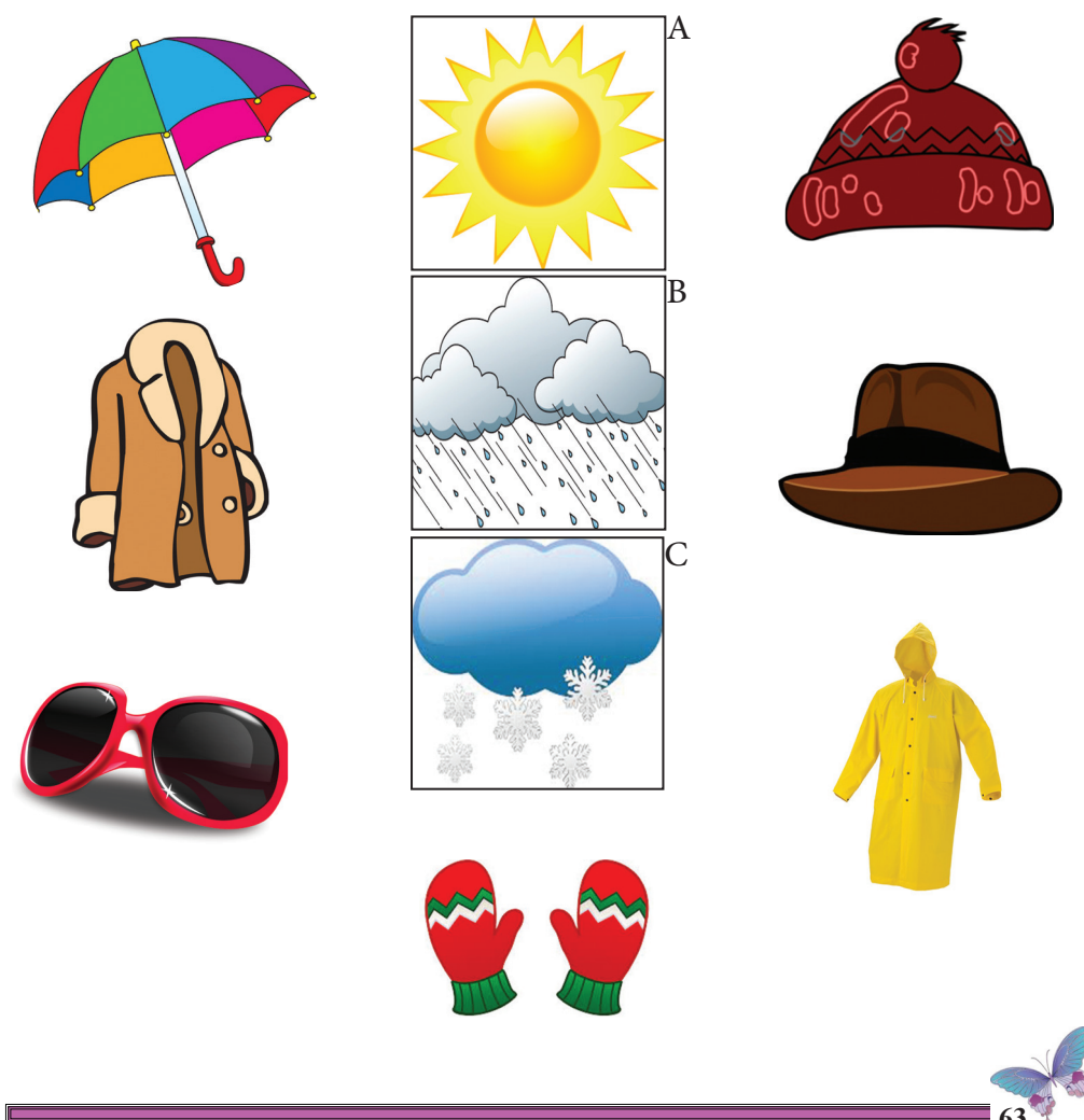
For free distribution

Match the symbols "A, B, C" with the pictures.