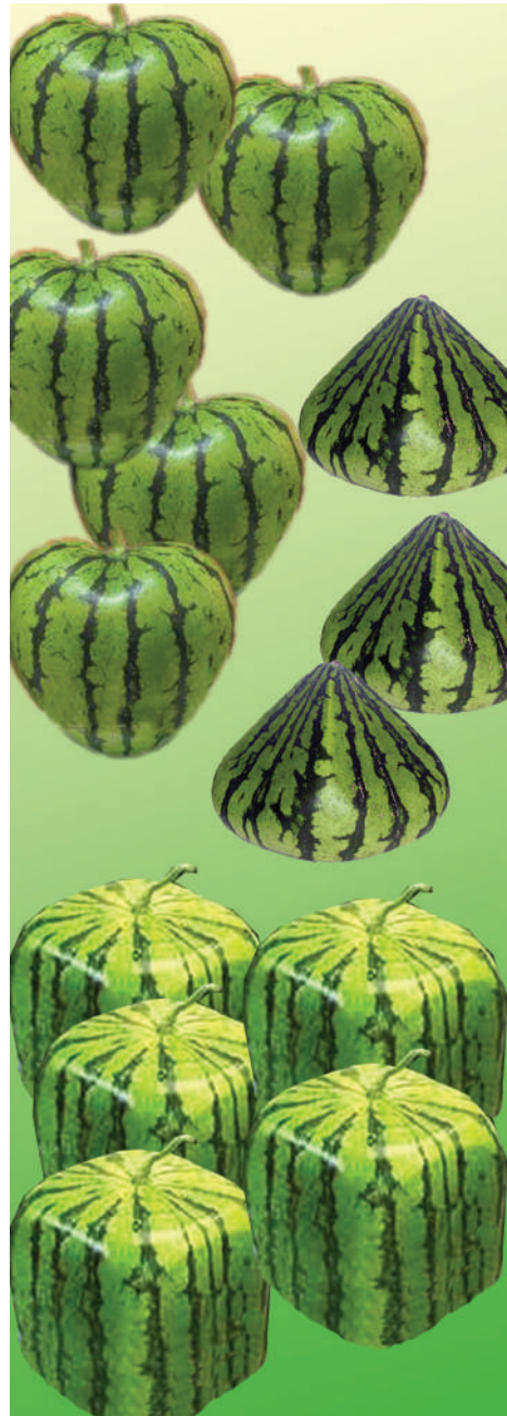
Figure 1.5 - Sweet melon that has undergone creativity

Creativity of people can be encouraged through financial rewards, appreciation and felicitations.