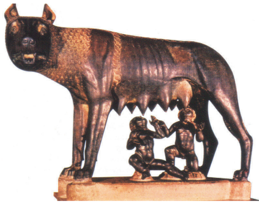
Statue reflecting the origin of Rome.

A legend is a story handed down from the past with a basis of truth. Many nations and states have legends associated with their origins. One legend associated with the origin of Rome is as follows.