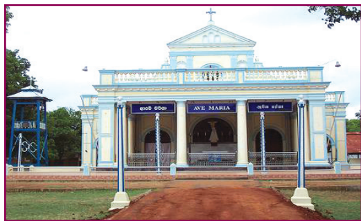
Fig 3.1 - Several religious places of Sri Lanka

Even though people are classified according to ethnicity as Sinhala, Tamil and Muslims, Sinhala speaking Tamils or Muslims and Tamil speaking Sinhalese can be seen in the country.