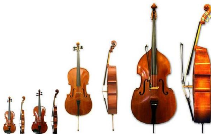
Violin Viola Violoncello Double Bass (Contrabass)

https://images.app.goo.gl/ZAx8tgM7KAig3jhD7