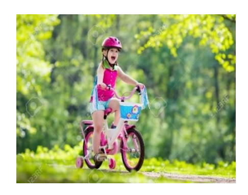
She <u>rides</u> the bicycle every morning.