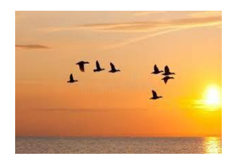
Birds <u>fly</u> in the sky.