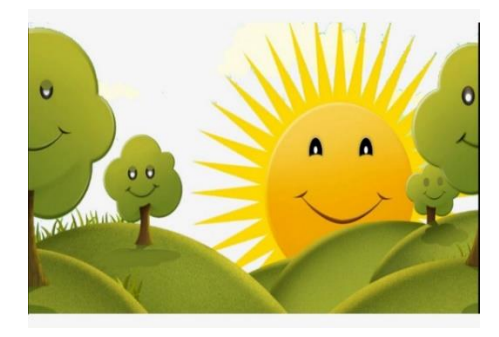
The sun <u>rises.</u>