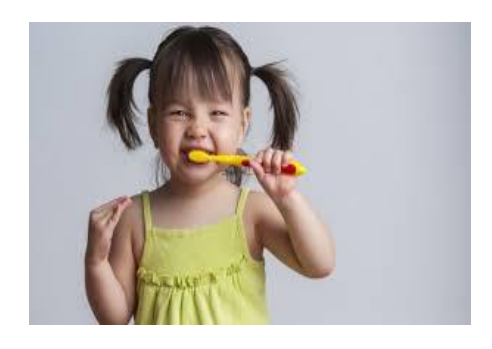
I brush my teeth.