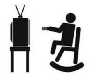
(watch, television, evening)