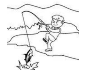
(catch, fish, hobby)