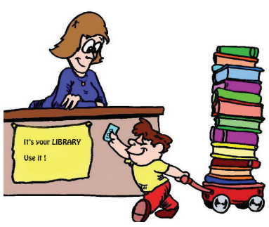
Eg- First you should visit the library. Then...

Imagine that one of your friends is interested in donating books to a library. Write the instructions you would give him or her to complete the work successfully. Follow the example given.