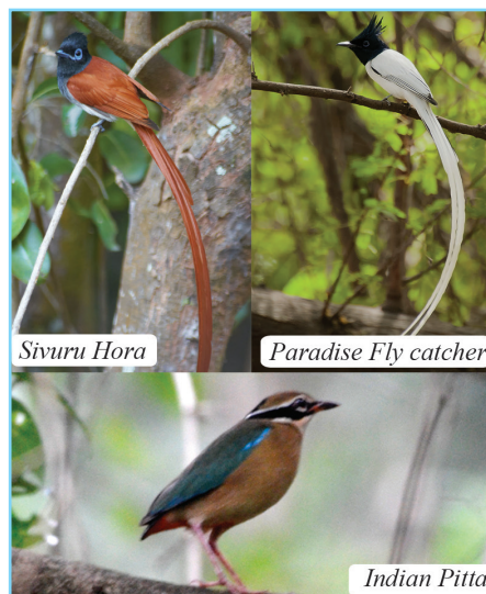
Figure 2.2 Migrant Birds

Sometimes, we see some birds migrating to our country during the winter season as they are unable to bear the coldness there. Those birds are migrant birds. Indian Pitta, Paradise fly catcher ( Sudu Redi Hora ) and Sivuru Hora are examples for migrant birds.