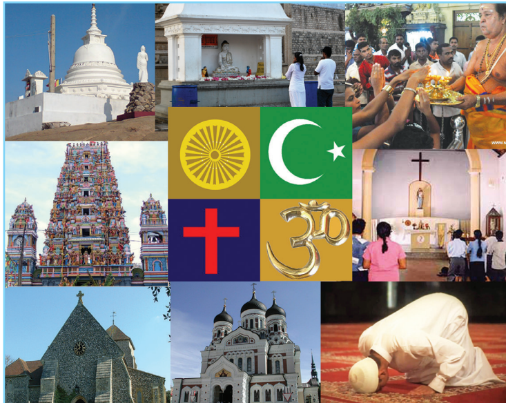
Figure 2.4 Various religious symbols and religious institutions

we should learn to live with them in co-operation. An example is, working with unity in sports activities, in various associations and in welfare activities without considering the ethnicity and the religion.