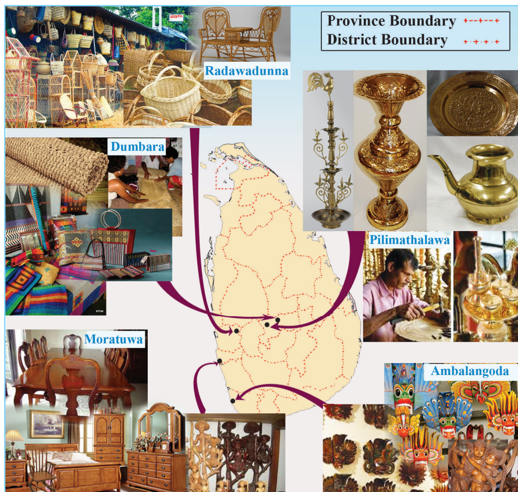
Map 2.1 Location of several industries based on traditional technological skills