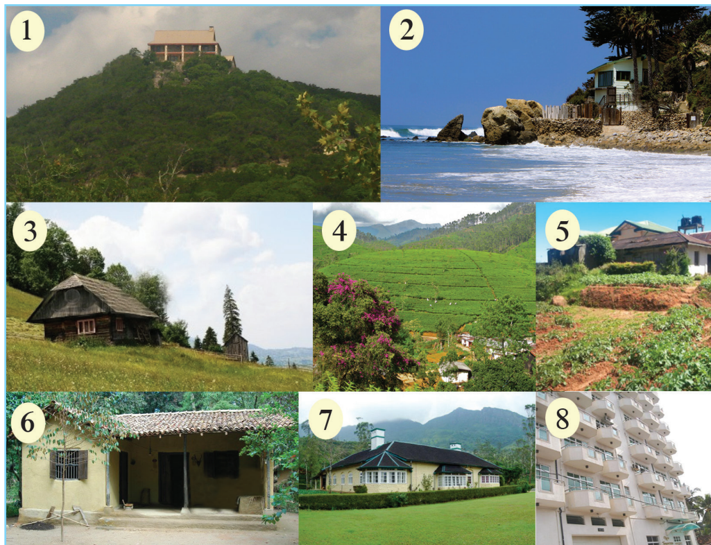
Figure 2.1 Houses located in different environments

Observe the houses located in different environments in figure 2.1.