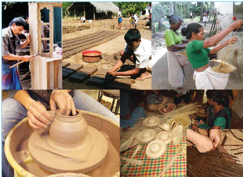
Figure 2.6 Industries based on resources found in the area

and bricks made using clay and flower pots and bricks produced using cement.