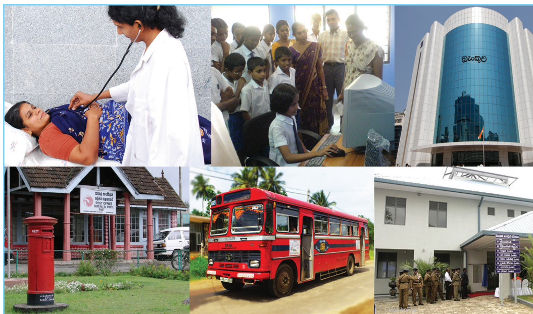
Figure 2.7 Various services

These services are important for the people in the area to maintain their day to day living.